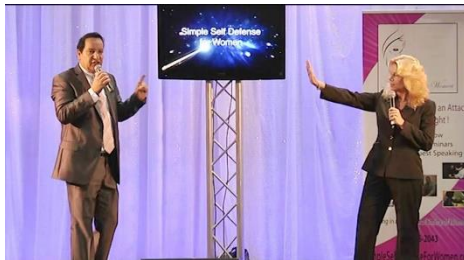
TV Guest Appearances